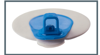
A = 4 mm fitting