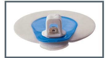
F = 3 mm fitting