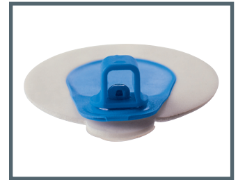
A = 4 mm fitting