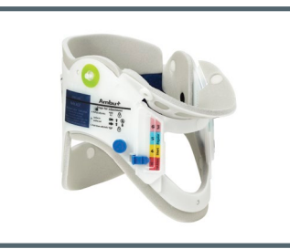
Ambu<sup>®</sup> Perfit ACE<sup>®</sup>