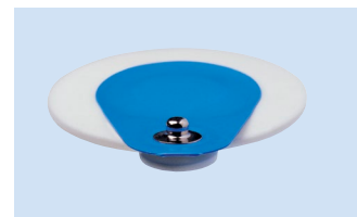
S = Stud