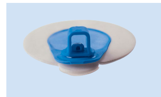
A = 4 mm fitting