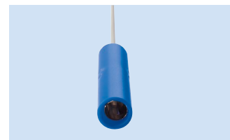
A = 4 mm connector