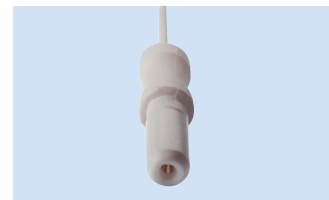
K = 1.5 mm connector