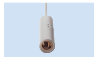
F = 3 mm connector